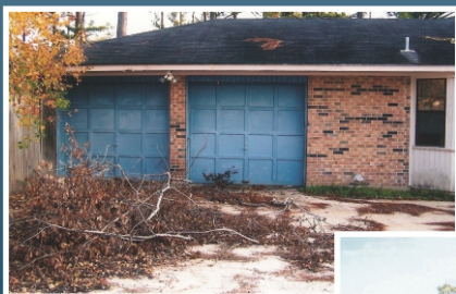
Post-Katrina Director's Home