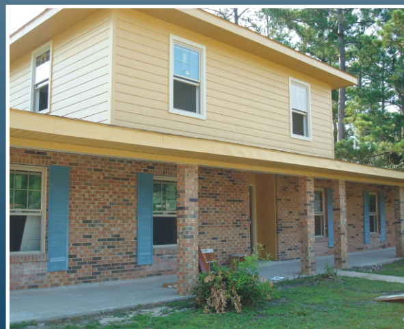
Summer 2008 Progress of Director's Home Rebuild

We're making progress! But we still need your help.