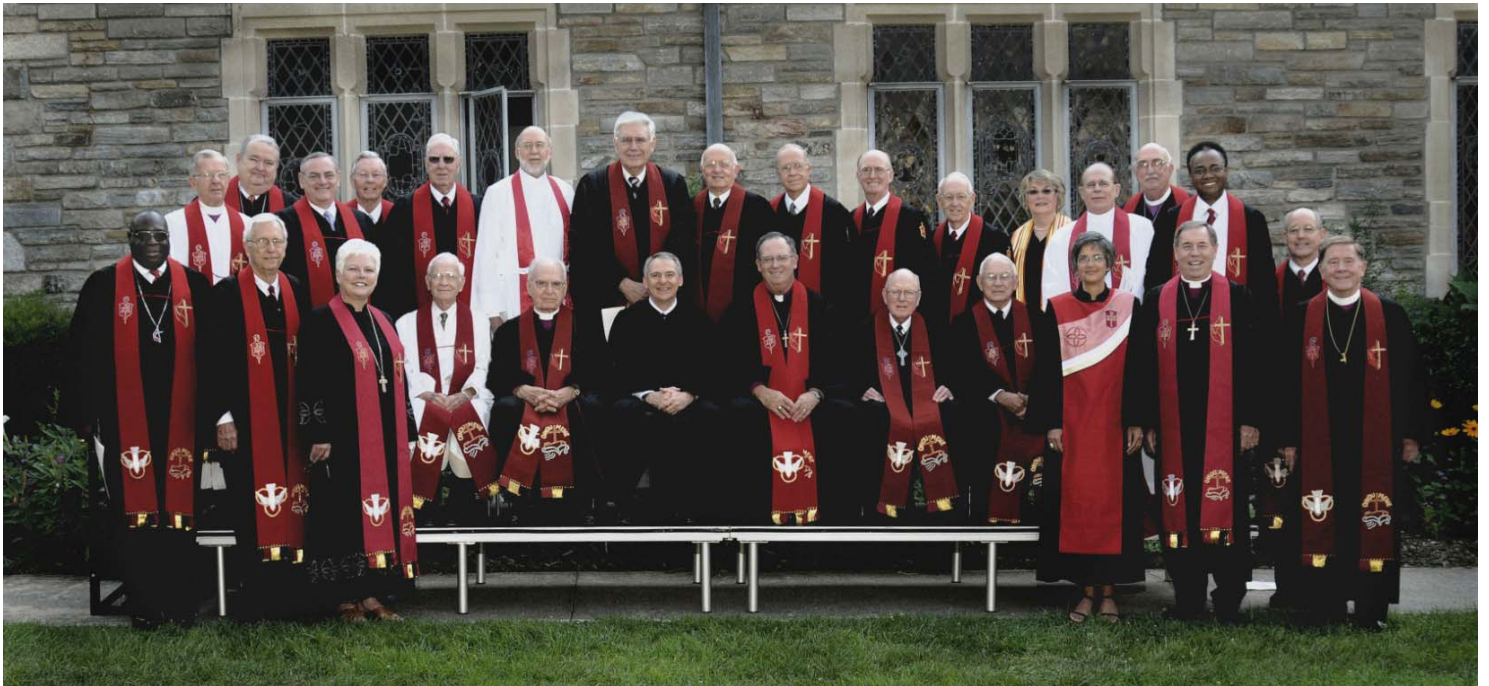
THE COLLEGE OF BISHOPS – 2008 SEJ CONFERENCE